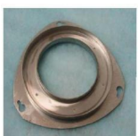
STI Size: 225