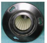
SK Plastic Size: 145 Key hole centre line D= 150mm. Cross reference: Freudenberg LP32 and LP33