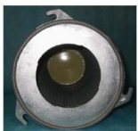
ALU TOP 3L Sizes: 145-218-325 Note: Fixing centre lines: 145= 203mm, 218= 263mm, 325= 394 mm Freudenberg's LP 145= 180mm