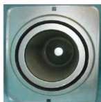
FT = Farr Tenkay Size: 325 Square top plate dim. = 406,5 x 362 mm.